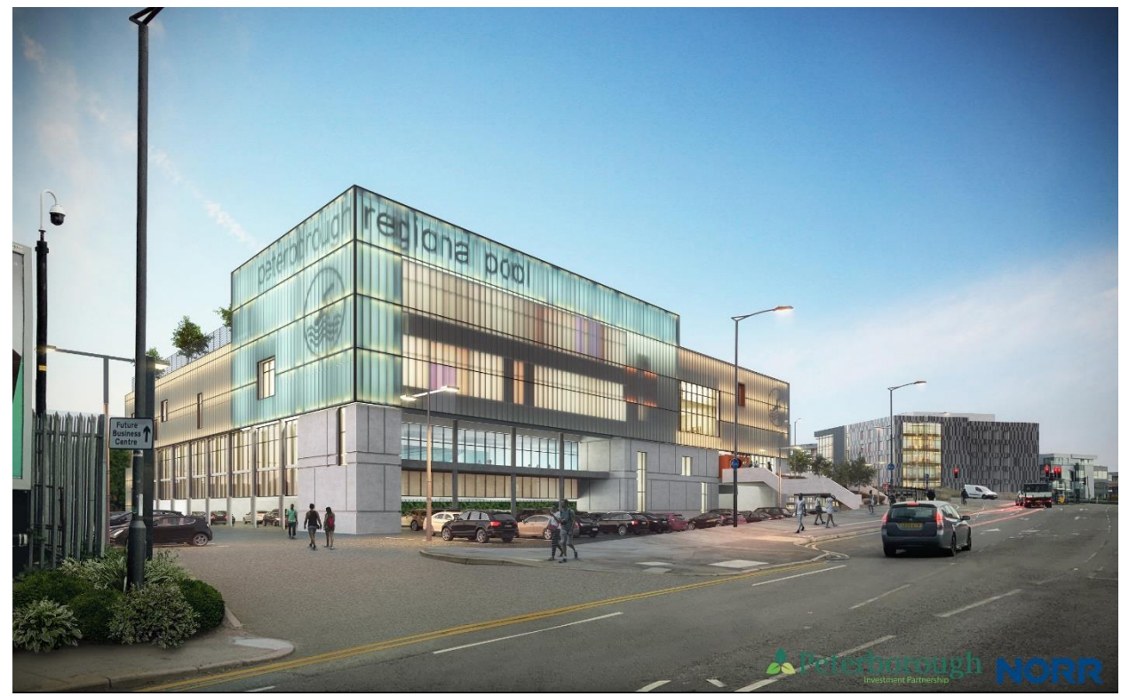
Figure 2: Artist impression of the potential scale and appearance of the Pleasure Fair's leisure centre

Alongside this exciting, landmark leisure scheme, PIP has begun work on developing a scheme for the Northminster area of the city, for which it secured an Option Agreement from the Council in December 2020. Much like Fletton Quays was, this c2.5-acre site is an underutilised part of the city centre with myriad challenges. PIP sees the Northminster redevelopment as an opportunity to regenerate a site that has unexplored potential, creating a new residential-led area near to the heart of the city centre. PIP is currently iterating design concepts and is soft-market testing these with a range of potential development partners, taking the same approach it did with the Fletton Quays scheme to ensure that deliverability is at the heart of PIP's design process. It is anticipated a planning application will be submitted in the spring.